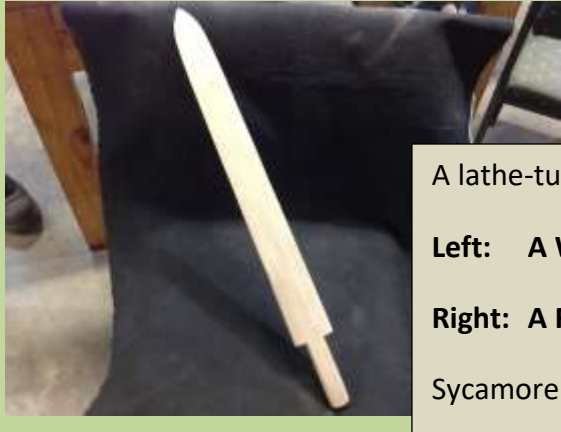
A lathe-turned tool for weavers.