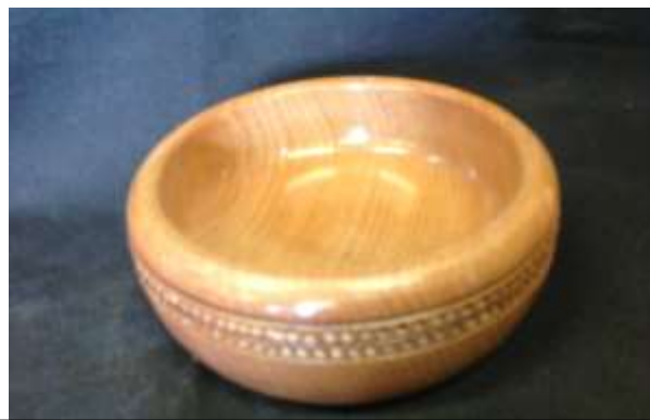
MALCOLM P applied our NEAGE philosophy for presentation/quality for this project.

A positive approach produces high quality outcomes every time.