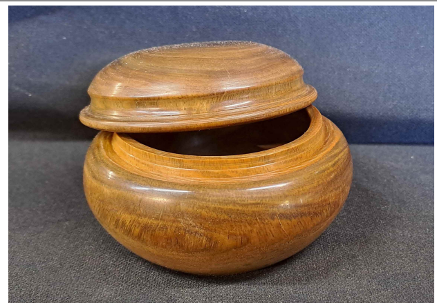
Lignum Vitae pot from Gary