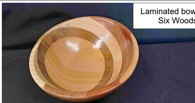
Laminated bowl with Six Woods

Pirongia based woodturners may be persuaded to do pick up for you, if you ask nicely.