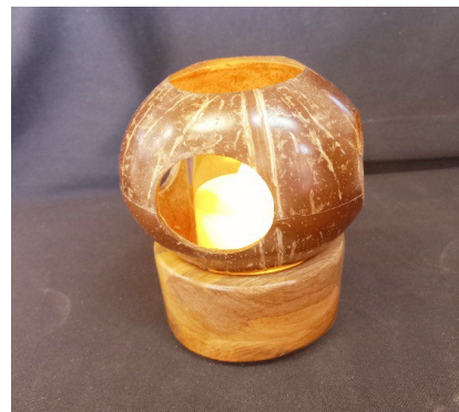
Michaels coconut shell lamp