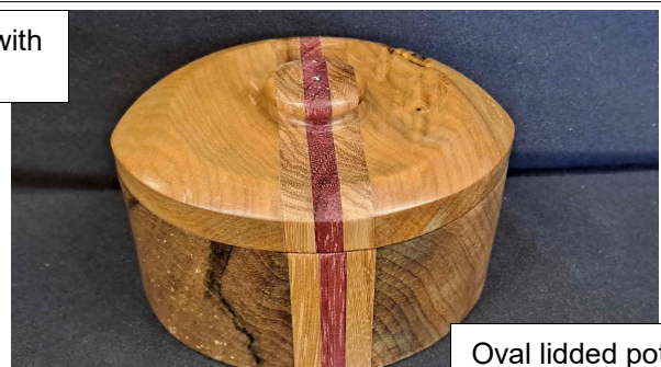
Oval lidded pot

As can be seen with these three items, Colin has also had a busy summer