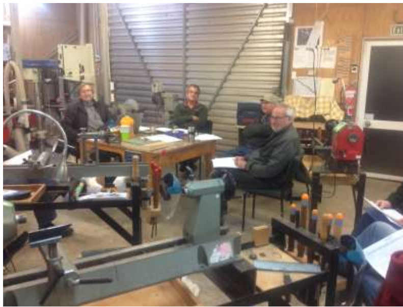
COIMMITTEE meeting last night (Tuesday 19th May)

HERE they are - your committee seated and spread out to comply with the Level2 requirements.