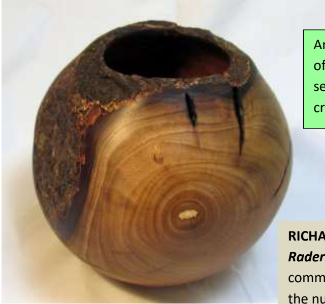
Another example of RICHARD's seriously clever creations.