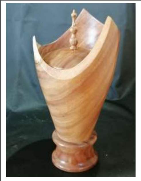
STEPHEN O'CONNOR used an oblong shape of Tasmanian Blackwood to make his very clever turning of a three-point pot with lid and finial. Another serious challenge well met.