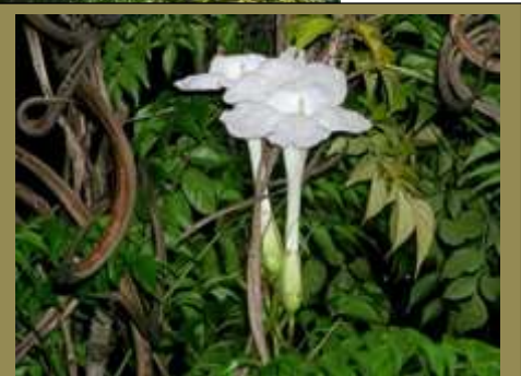
insert: China Doll flowers, seed pods and leaves

That's LOCKDOWN EXPRESS NO 7. (No 8 coming up as soon as enough contributions are sent to me). There are some quite outstanding works of wood art being produced by our club members. I am quite proud of your progress and achievements. Keep up the great work.