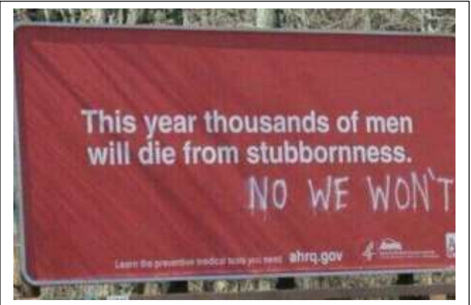
More funny signs photographed by world tourists.