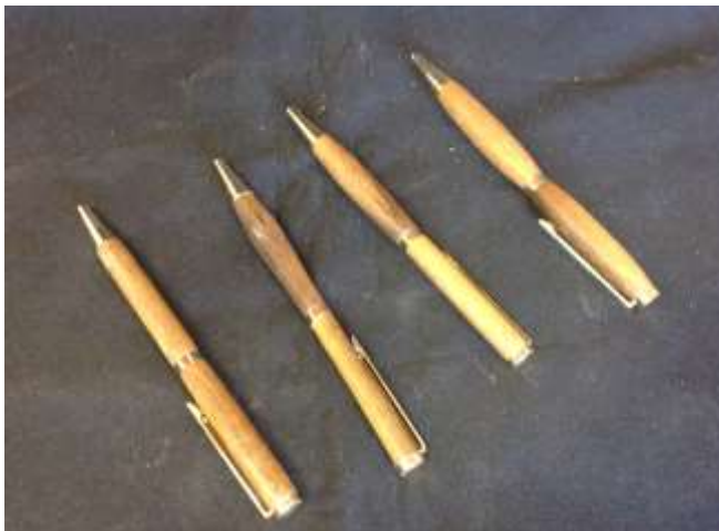
The team of newbies learned the basic skills of turning a pen. (Ironwood)