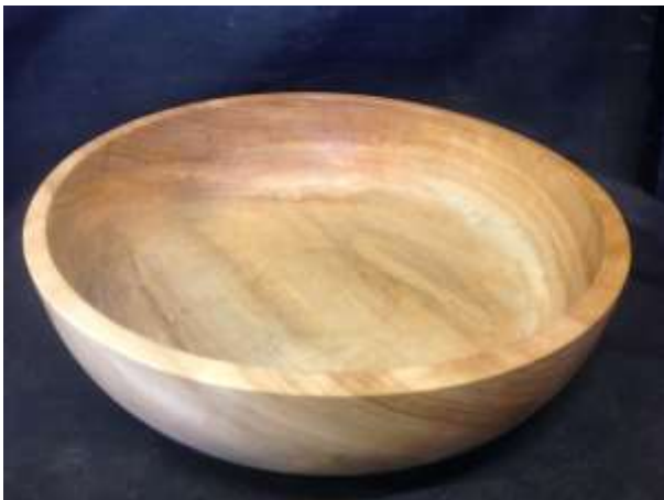
Poplar wood was used for MIKE'S bowl. A very good result given that Mike had to deal with the wood's instability.