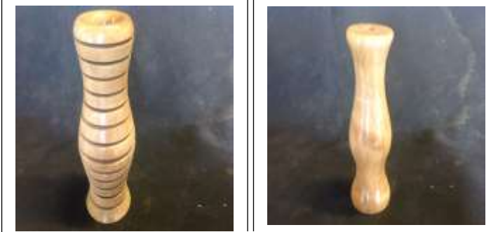
DAVID Mollekin experimented with shapes and designs with smaller turnings