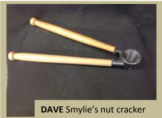
DAVE Smylie's nut cracker is ready to go for Christmas