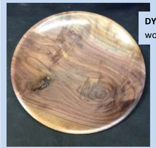
DYLAN can whip out a quality walnut wood platter in a very quick time