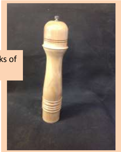
ROSS has joined the ranks of successful mill makers