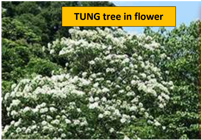
TUNG tree in flower

For a full report on TUNG oil check our website.