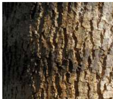
The bark of all three ashes can look like this. Smooth but furrowed.

DESERT ASH shown wearing its typical autumn tones