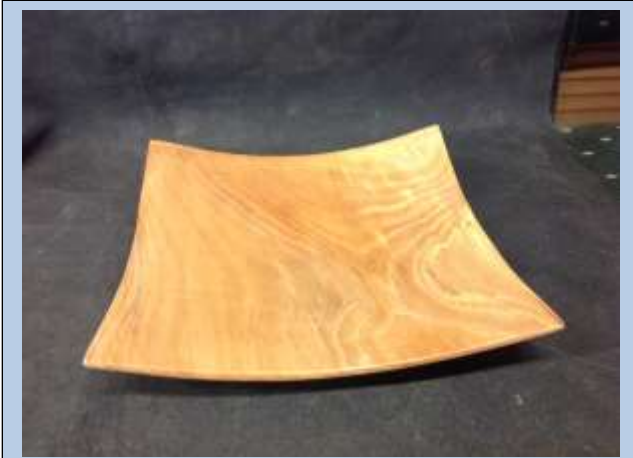
RICHARD used a slab of grainy totara wood to fashion this up-curved, square, thin-walled platter. A top job.