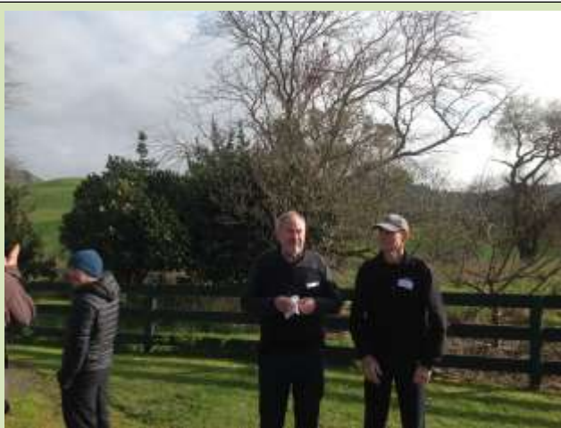
Some members of the visiting group had a tour of the gardens as well