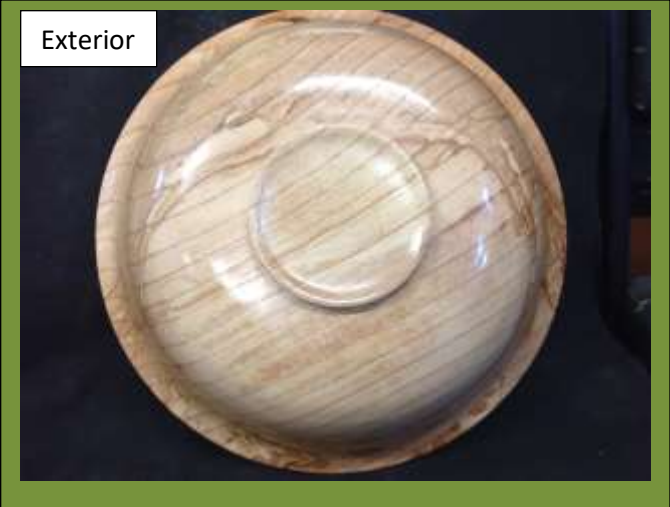
DAVID COWLEY used a large block of spalted ASH to make this humdinger salad bowl. The prominent grain lines are truly impressive. Food-safe oil is smeared inside the bowl while the outside has been waxed and buffed. A "Goodonya" gong for this special turning job.