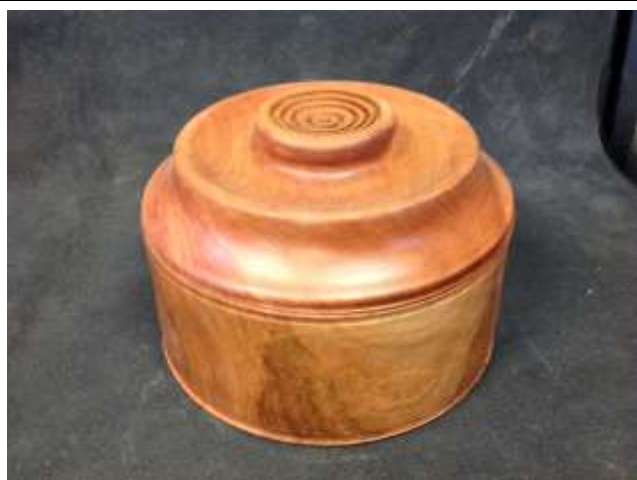
GARY turned this pot using walnut and cherry wood.