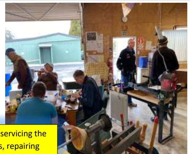
Club members hard at work servicing the chucks, checking the banjos, repairing the No12 lathe (again), sharpening the skewers, fitting new gouge tips, lubricating the lathe parts, tidying the shelves, fitting lighting, renumbering the lathes etc, etc,