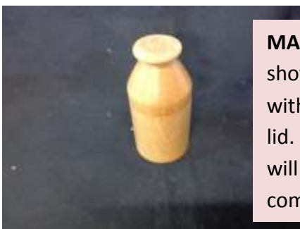
MALCOLM's first shot at a mini-pot with a flush-fitting lid. Methinks there will be more pots to come. Woo Hoo!