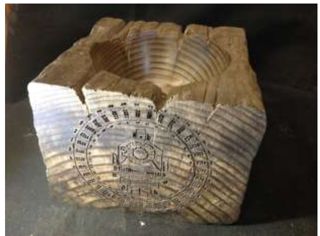
DYLAN beavered away at this very special project. (history revitalized)