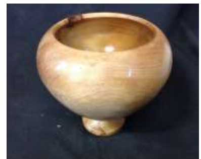
Three pictures above capture the turning creations by our Gideon . Very smart work here.