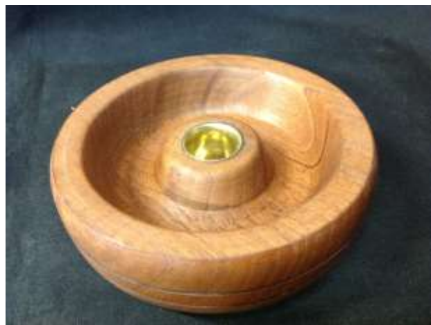
CORMAC makes great progress with his candle holder.