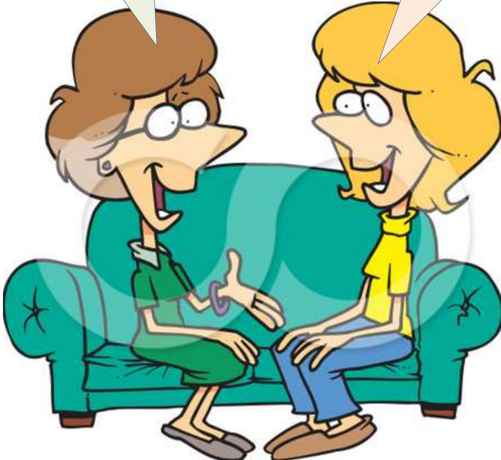
Two knowledgeable rugby stalwarts

Yeah. The Springboks were lucky to get "0" eh!