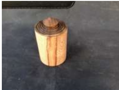
SHAUN used rewarewa and black walnut wood for his natty mini-pot.