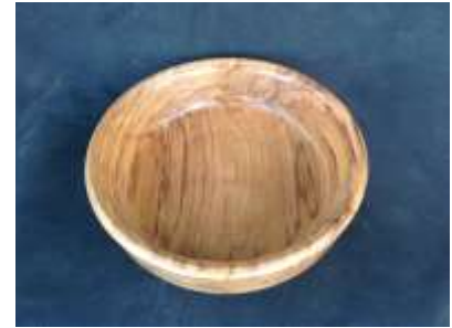
MICHAEL turned a block of four pieces laminated rimu wood into a large shallow bowl. The laminations helped to create interesting grain patterns