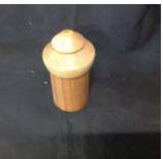
RIC used rimu wood for the pot and kauri wood for the friction-fitted lid. More essential skills were learned during the job.