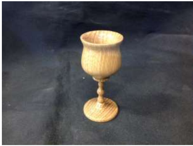
AARON's skillfully turned mini-goblet