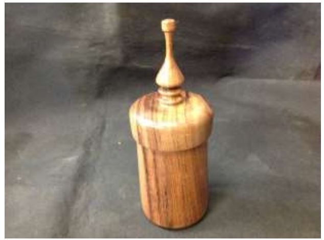
A superb mini-pot by AARON