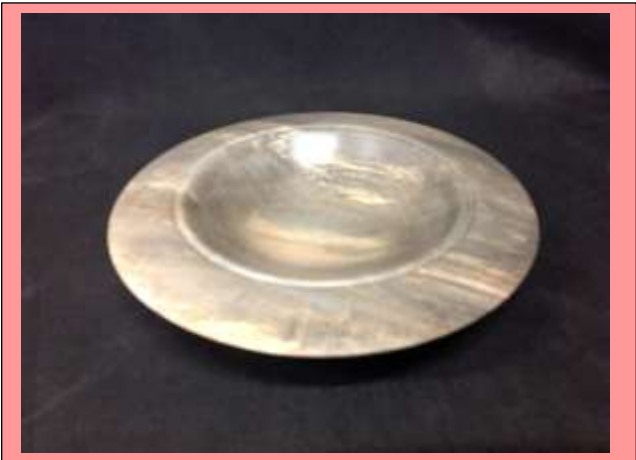
"Accept no second-best" MURRAY has turned a small block of highly coloured oak wood into an eye-catching treasure. Shape, proportion and design are notable features of his work.