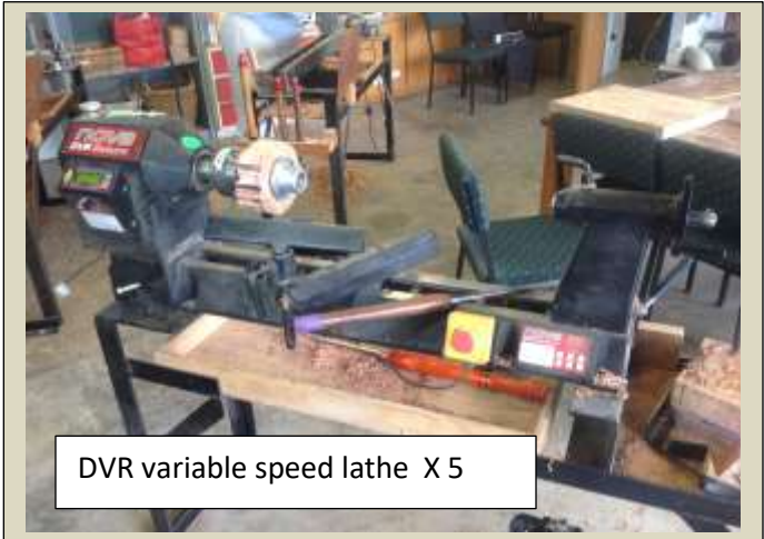
DVR variable speed lathe X 5