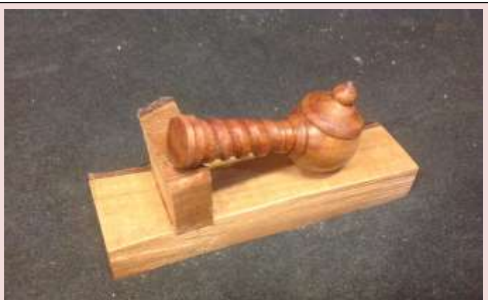
Small, intricate and a novel shape. Well done GRAEME