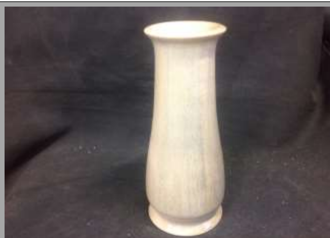
New turner MIKE showed us he has a good eye for vase shapes with this poplar wood creation. A great finish with white diamond buffing followed by canauba wax application