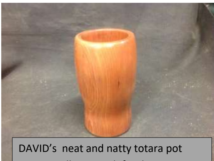
DAVID's neat and natty totara pot sports a silky-smooth finish