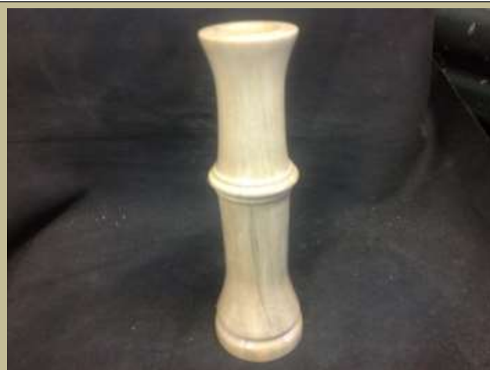
Another new turner TRAVIS produced this candle holder using poplar wood and he too used the buffer to attain a great finish.