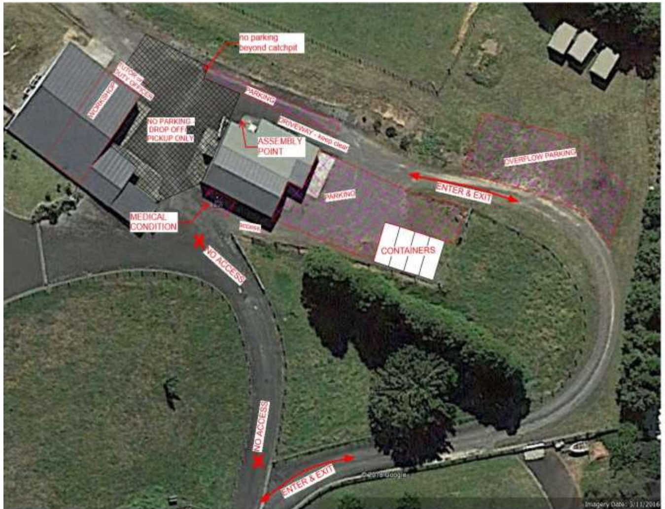
Hamilton Woodturners Club - site access, parking and assembly point

PARKING .... an issue that needs to be addressed. All members are requested to use this plan to be reminded about where parking is available and where parking is not permitted.