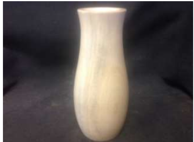
CHARLOTTE (left) and LANCE LYDEN (right) used poplar wood to make their classic "S" shaped vases. These new turners are making rapid progress through the club's induction programme. Woo Hoo!