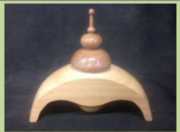
DAVID is always prepared to have a go at something different and the end results are always pleasing to any discerning eye. These two projects are fine examples of some skilled turning techniques.