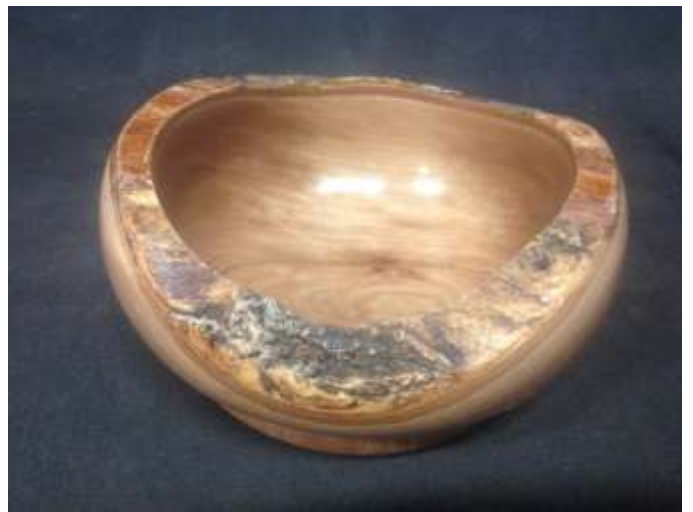
Another very carefully finished natural edge bowl from IVAN