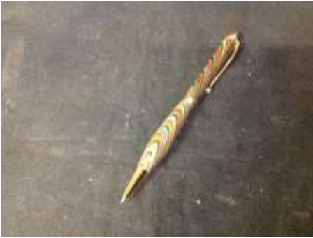
PETER's multi-layered pen