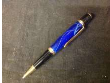
GRAEME's Sierra pen