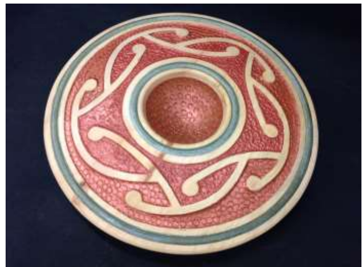
Design and colour make appeal and add other dimensions to a turner's work eh MURRAY.

OK that's the TT for this week. After the poor showing by the Chiefs last week I'm glad of a month's rest from Super Rugby. Next up at Rugby Park it's a game against the mighty Welshmen. No predictions here but I expect supermarkets will experience a run on LEEK SOUP after the game.