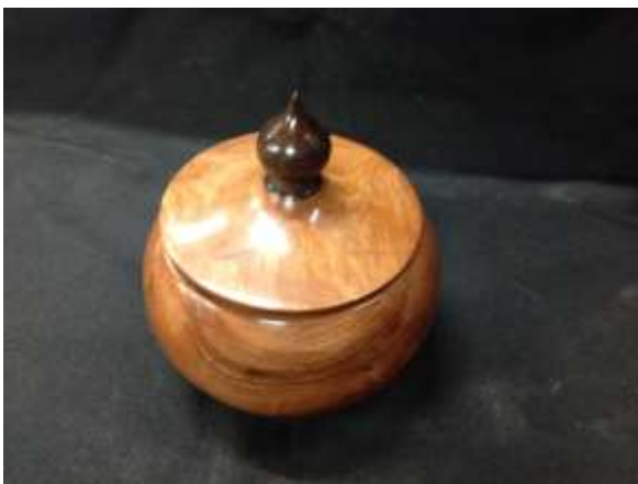
MAURICE's beautifully crafted lidded bowl shows off its colours being enhanced by the Beall buffing system.