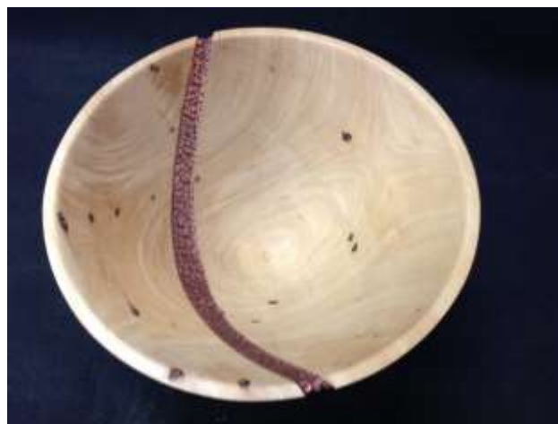
A little bit of artists' paint adds interest to MURRAY's bowl