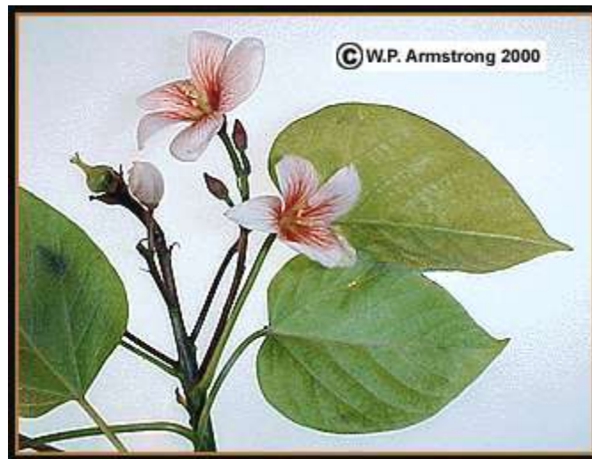
Tung oil tree ( Aleurites fordii ) showing two male flowers and one female flower (left) in which the petals have fallen off exposing the pistil.

For centuries tung oil has been used for paints and waterproof coatings, and as a component of caulk and mortar. It is an ingredient in "India ink" and is commonly used for a lustrous finish on wood. In fact, the "teak oil" sold for fine furniture is usually refined tung oil. Some woodworkers consider tung oil to be one of the best natural finishes for wood.