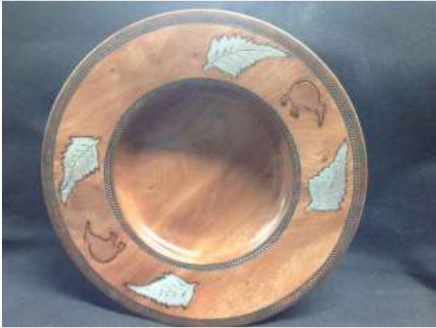
An excellent turning by COLIN