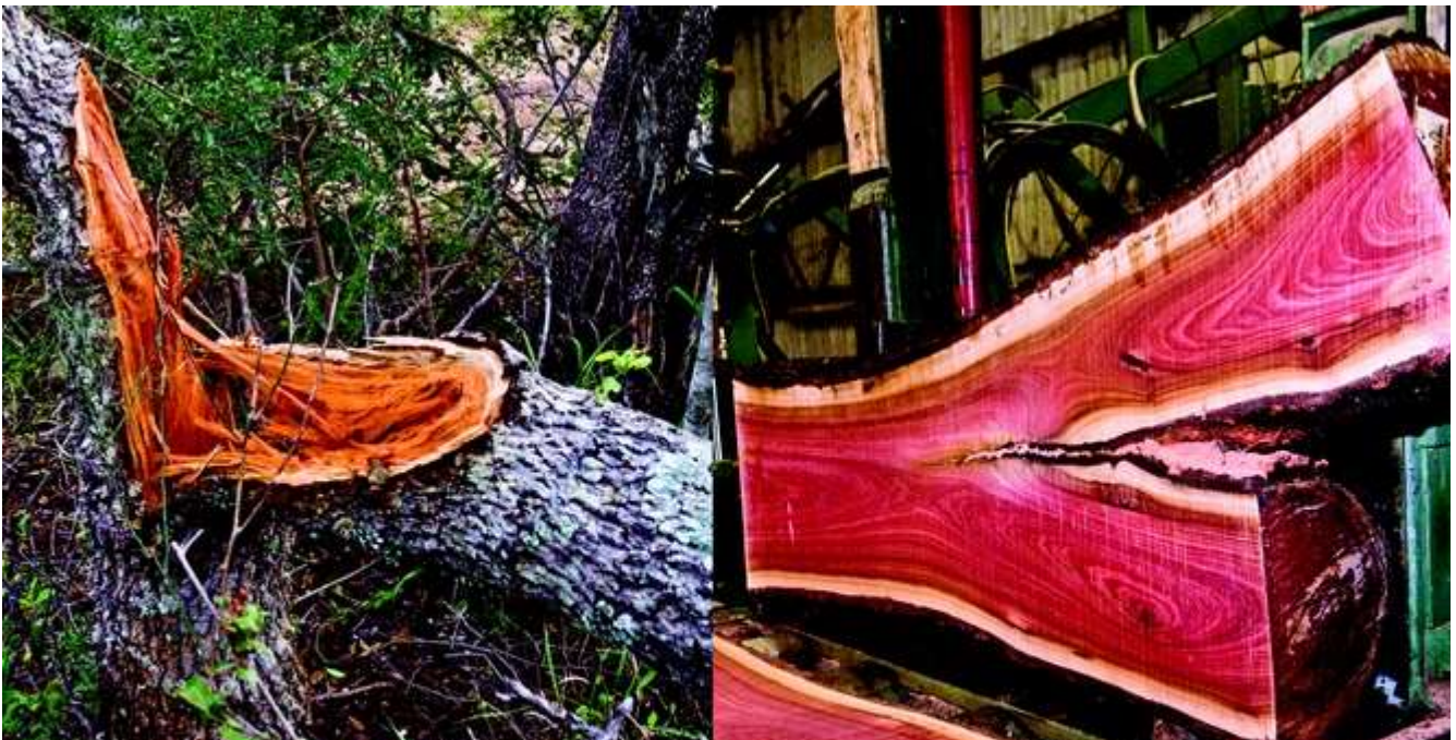
Above is a picture of a pink ivory tree, which was pushed over by an elephant. That elephant sure did the lucky finder a big favour.

Methinks PINK IVORY could be Fred Irvine's favourite wood