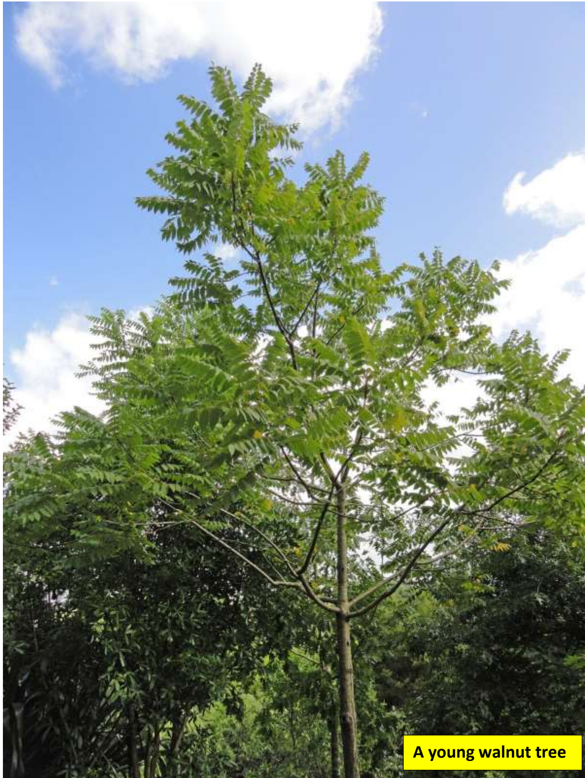
A young walnut tree