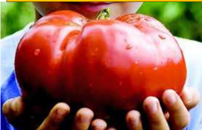
One of my smaller "tommies"